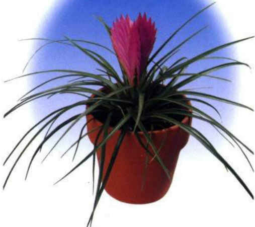
TILLANDSIA Cyanea '3-D'