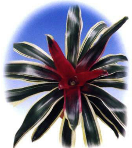
NEOREGELIA 'Raphael' ®