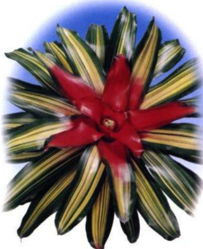
NEOREGELIA 'Devroe' ®