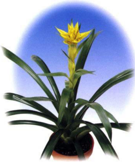
GUZMANIA 'Puna Gold' ®