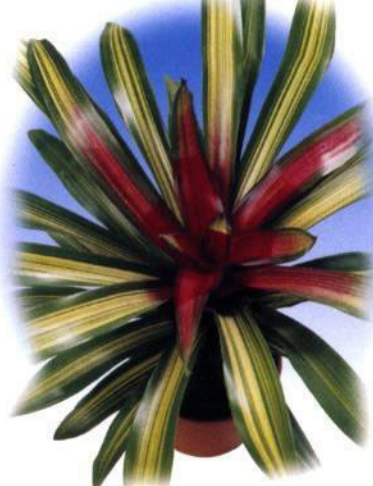
NEOREGELIA 'Martin' ®