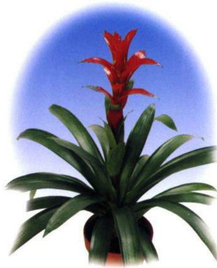
GUZMANIA 'Rana' ®