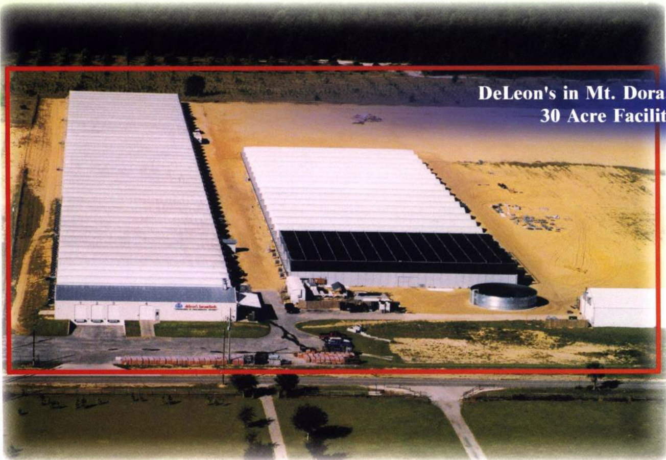
DeLeon's in Mt. Dora, Florida 30 Acre Facility