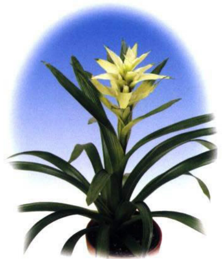
GUZMANIA 'Snowball' ®