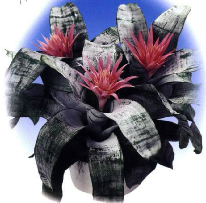
10" Fasciata Triple