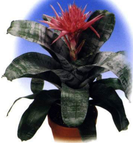
AECHMEA fasciata 'Primera'®