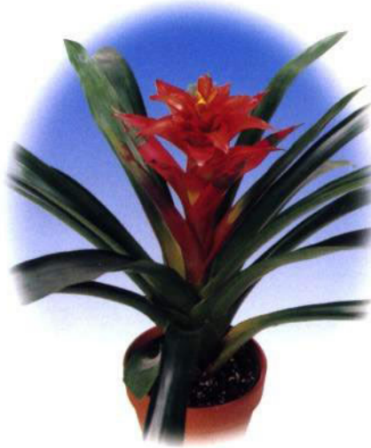
GUZMANIA 'Tutti Frutti' ®