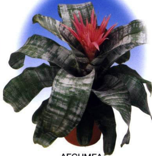
AECHMEA fasciata 'Superb'®