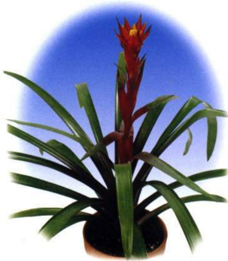
GUZMANIA 'Kapoho Flame'®